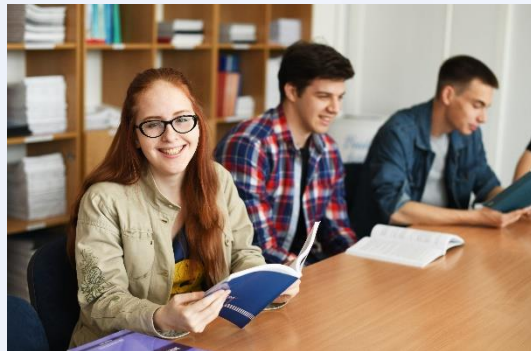
Tourism and hospitality

Faculty is licensed for the contemporary study courses of undergraduate studies in the fields of: