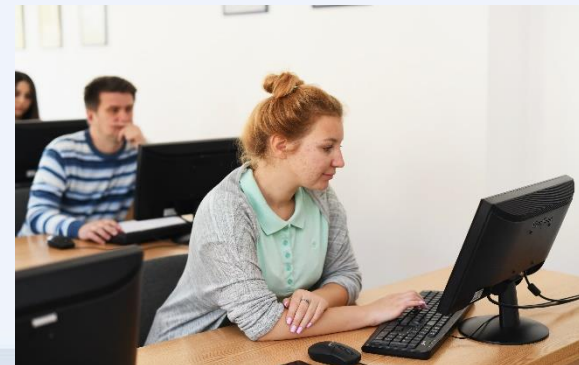
Business Informatics and Electronic Business