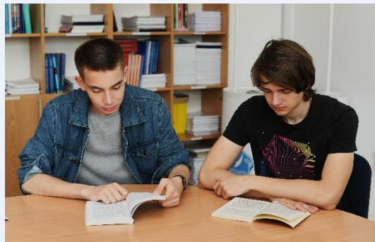
Taxes, Customs and Insurance