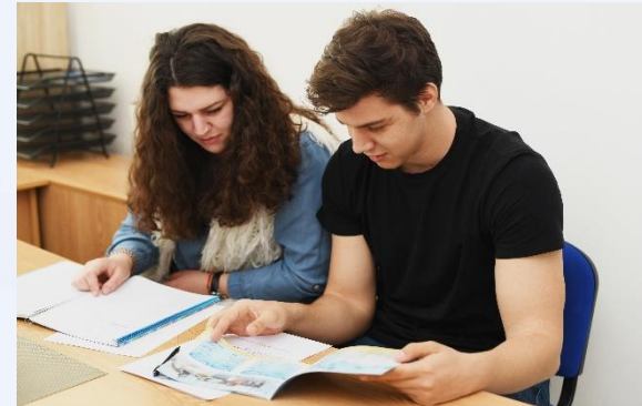
Finance, Accounting and Banking